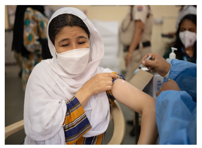
Refugees receive their COVID-19 vaccinations in New Delhi, India.